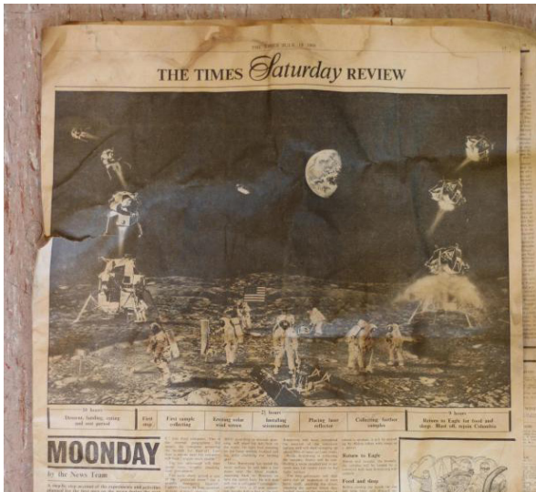
'Moon landing newspaper found during work at Chard School'

Banner headline from the Chard & Ilminster News July 2023. With all the children on holiday and away from school; all quiet and no happy chatty children on site what better time to carry out refurbishment work at Chard School? However, hidden away amidst some plumbing